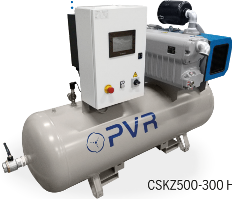
CSKZ500-300 HWT VFD